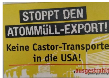
Sticker by the German anti-nuclear group .ausgestrahlt (in Hamburg): “ Stop the Nuclear Waste Export! No Castor Cask Export to the USA! ”