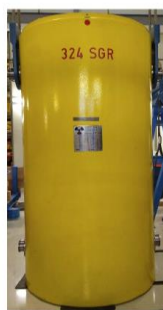
152 Behälter vom Typ CASTOR AVR/THTR