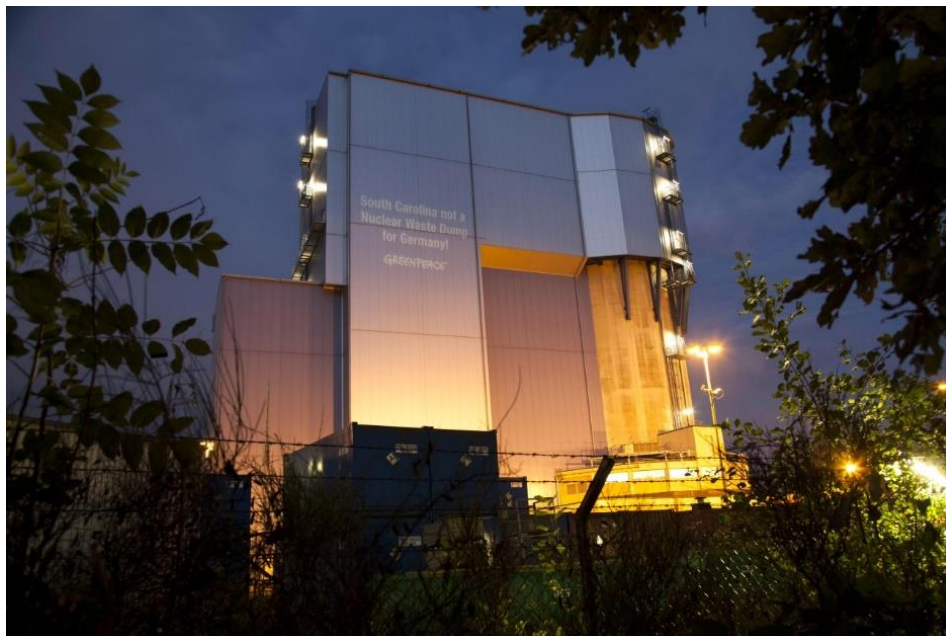
AVR reactor at the Jülicher Research Center in 2014, before its dismantlement. The reactor was subsequently removed and placed in a special storage facility on site. The words projected onto the reactor building by Greenpeace read "South Carolina not a Nuclear Waste Dump for Germany."

The research to process the graphite balls - for uranium removal and for disposal of the radioactive graphite - has taken place at Savannah River National Laboratory. As stated earlier, DOE is now on modification #9 of the initial 2012 agreement, which runs through February 2023. Since 2016, those agreements have been between SRS and a new entity created to manage the AVR spent fuel, the Jülicher Entsorgungsgesellschaft für Nuklearanlagen mbH (JEN).