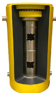
Pro Behälter 2 AVR-Transport- und Lager-Kannen